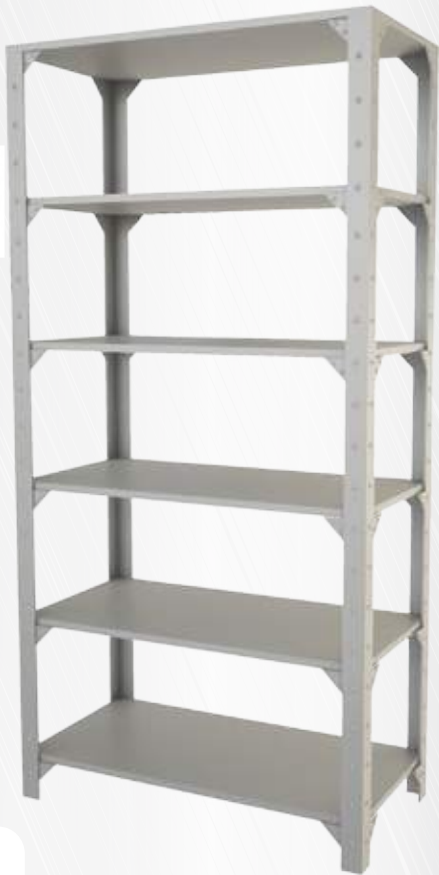
Slotted Angle Rack Standard D 450mm x W 900mm x H 1,800mm