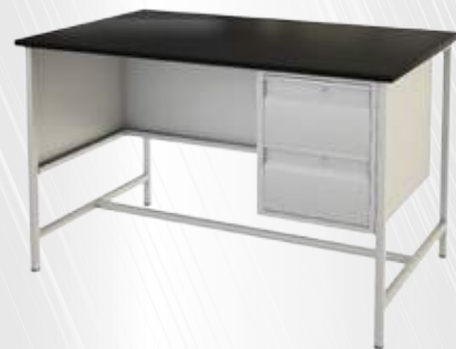
Standard Table (ST-02) with 2 Drawers D 760mm x W 1270mm x H 760mm