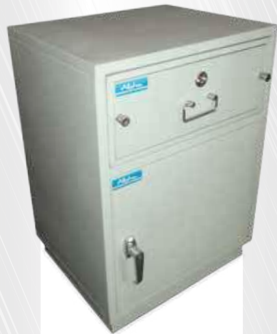
Teller Cabinet Std D813mm x W 508mm x H 758mm