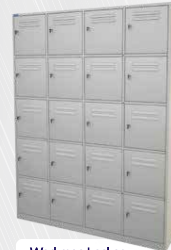
Workmen Locker Standard 20U / DS12 x 36 D 382mm x W 1330mm x H 1678mm