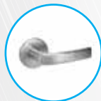
Lever Door Handle