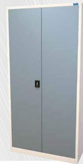
Sahara Steel Cupboard Standard D 460mm x W 915mm x H 1830mm ▪ Powder Coated finish ▪ Adjustable shelf ▪ Made out of 0.7mm cr sheet ▪ more Secure Lock