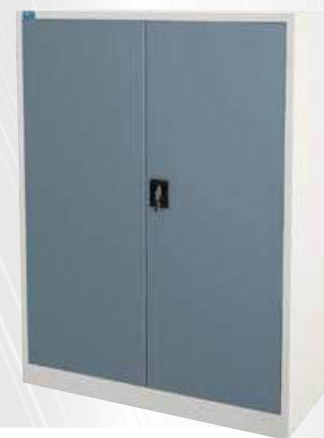
Sahara Steel Cupboard Medium D 460mm x W 890mm x H 1220mm ▪ Powder Coated finish ▪ Adjustable shelf ▪ Made out of 0.7mm cr sheet ▪ more Secure Lock

Our extensive range of designer, contemporary and traditional office furniture offers everything you need for a functional and stylish workplace. We put our customers at the heart of our business and pride ourselves on providing quality products with a first class service from our friendly and professional team.