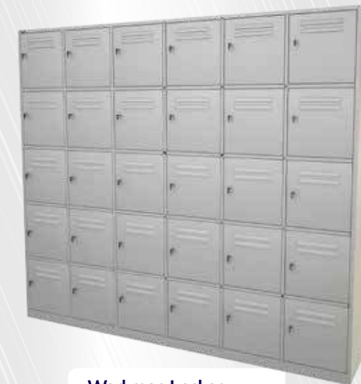
Workmen Locker Standard 30U / DS12 x 12 D 382mm x W 1978mm x H 1676mm