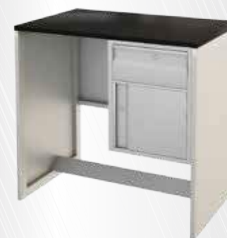
Standard Table (ST-04) with Drawer & Cabinet D 508mm x W 813mm x H 762mm