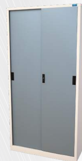
Sahara Steel Sliding Cupboard Standard D 460mm x W 915mm x H 1830mm ▪ Powder Coated finish ▪ Adjustable shelf ▪ Made out of 0.7mm cr sheet ▪ more Secure Lock