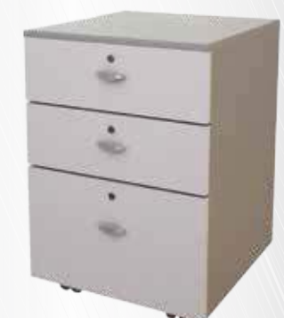
Sahara Drawer Three Drawer D 450mm x W 456mm x H 685mm