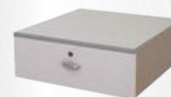
Sahara Drawer One Drawer D 447mm x W 316mm x H 145mm