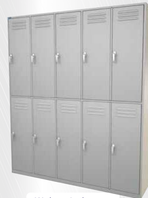
Workmen Locker Standard 10U / DS12 x 36 D 458mm x W 1655mm x H 1922mm