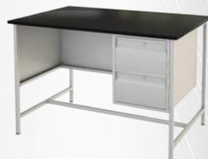
Standard Table (ST-03) with 2 Drawers D 610mm x W 1070mm x H 762mm