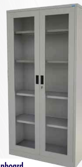
Library Cupboard 72 inch D 460mm x W 915mm x H 1830mm ▪ Available with and without lege. ▪ Available in 0.58mm and 0.7mm.