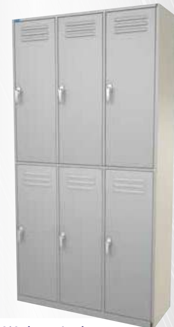
Workmen Locker Standard 6U / DS12 x 12 D 458mm x W 1004mm x H 1922mm