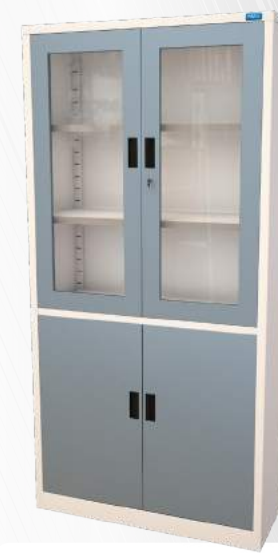
Sahara Display Cupboard Standard D 460mm x W 915mm x H 1830mm ▪ Powder Coated finish ▪ Adjustable shelf ▪ Made out of 0.7mm cr sheet ▪ more Secure Lock