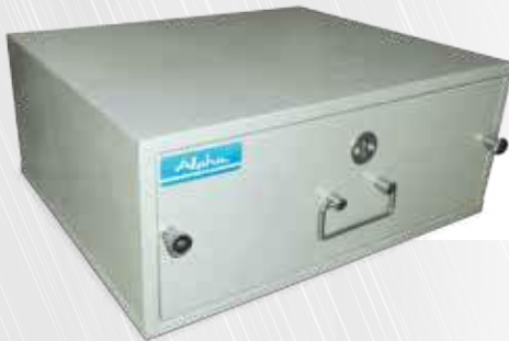
Removable Cash Drawer D 500mm x W 385mm x H 640mm