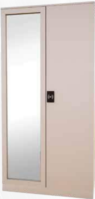
Hawana Wardbore D 457mm x W 915mm x H 1830mm