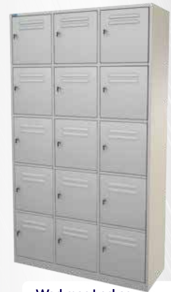
Workmen Locker Standard 15U / DS 12 x 12 D 382mm x W 1004mm x H 1678mm