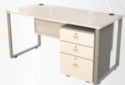
Sahara Manager Table D 700mm x W 1500mm x H 755mm