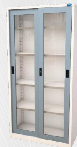
Sahara Glass Sliding Cupboard Standard D 460mm x W 915mm x H 1830mm ▪ Powder Coated finish ▪ Adjustable shelf ▪ Made out of 0.7mm cr sheet ▪ more Secure Lock