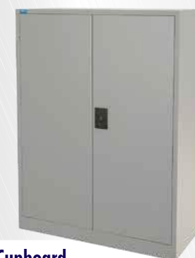
Steel Cupboard 48 inch D 460mm x W 890mm x H 1220mm Available in 0.58mm and 0.7mm