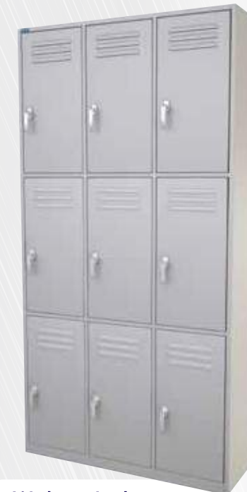
Workmen Locker Standard 9U / DS12 x 36 D 382mm x W 1014 mm x H 1941mm