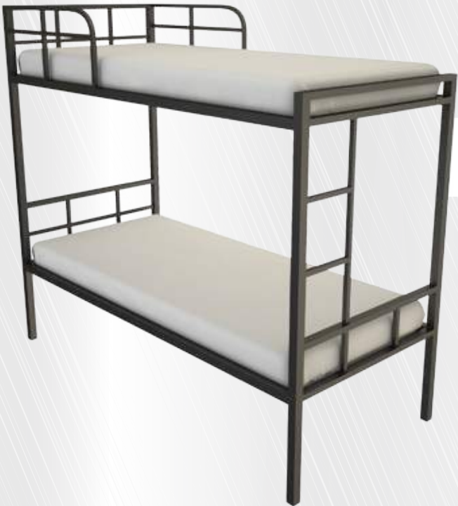
Bunk Bed - Standard (Plywood Base) D 915mm x W 1990mm x H 1780mm