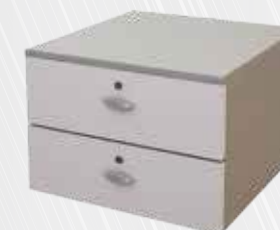
Sahara Drawer Two Drawer D 447mm x W 316mm x H 267mm