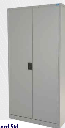
Steel Cupboard Std 72 inch D 460mm x W 915mm x H 1830mm ▪ Available with and without lege. ▪ Hasp and staple options are available. Additional shelves are available. ▪ Available in 0.58mm and 0.7mm.