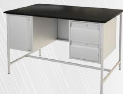
Standard Table (ST-02) with 2 Drawers & Cabinet D 760mm x W 1270mm x H 760mm