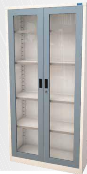
Sahara Library Cupboard Standard D 460mm x W 915mm x H 1830mm ▪ Powder Coated finish ▪ Adjustable shelf ▪ Made out of 0.7mm cr sheet ▪ more Secure Lock