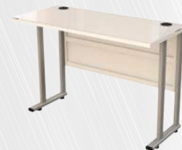
Sahara Staff Table D 500mm x W 1100mm x H 755mm